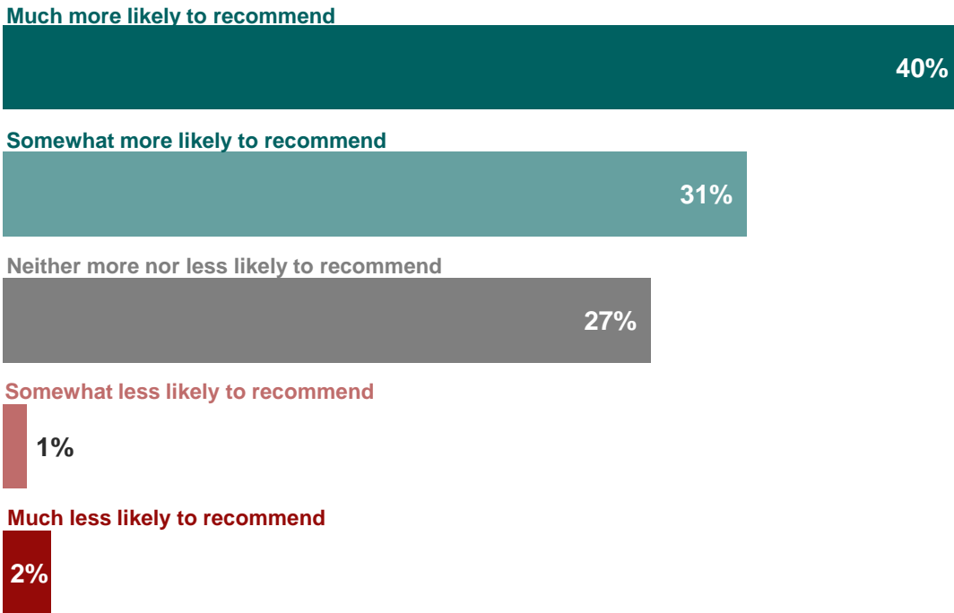
Figure 2: Seeking Care at a Hospital With A Higher Percentage of Board Certified Nurses*

If you learned that a hospital had a high percentage of nurses with a specialty board certification, would you be more or less likely to recommend that hospital to a family or friend, or would it have no impact either way?